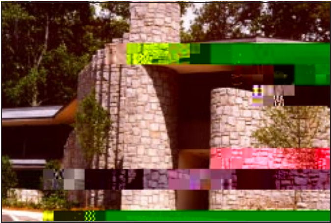
A view of the Luce Center on Emory Campus, new home to ASOR's Publications program.